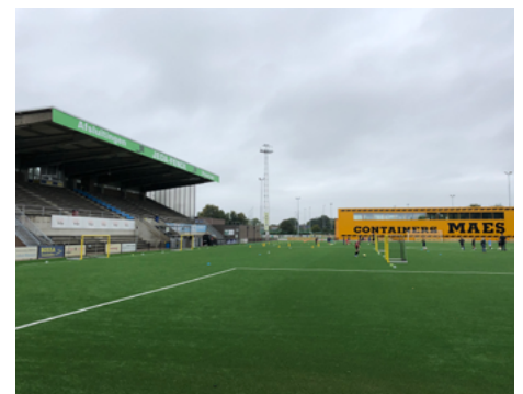
KVV THES SPORT VZW Tessenderlo, Belgium

www.greenfields.eu E: info@greenfields.eu T: +31 (0)548 633 333