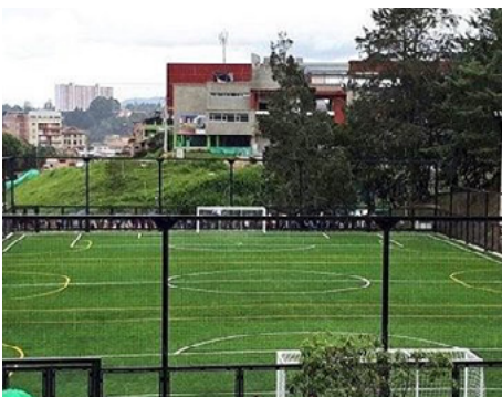
RIONEGRO COMMUNITY FIELDS Rionegro, Colombia