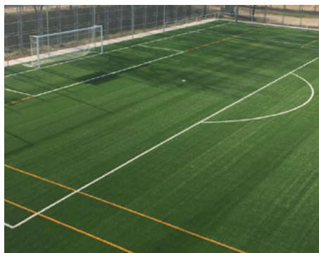
CARABANCHEL FOOTBALL SCHOOL • Madrid, Spain